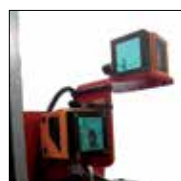
1 Laser detector Laser sensor for upper row to detect presence of boxes in the upper part of the pads.