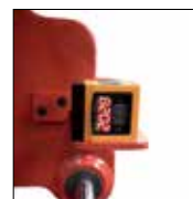
4 Depth load engagement sensors Detect type and configuration of the load in depth/height and the distance from the clamp body.