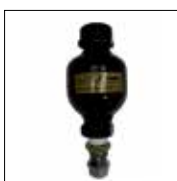
2 Accumulator Stabilizes the clamping pressure avoiding unwanted peaks of pressure, potentially dangerous for the load.