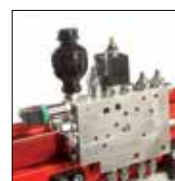
3 Proportional valve Commands the hydraulic pressure in the clamping cylinders.