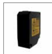
5 Opening laser sensor Detect the opening of the clamp and position of the arm