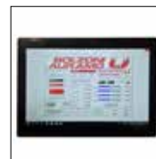
Set up Tablet Controls the parameters of the pressure configuration based on opening ranges.